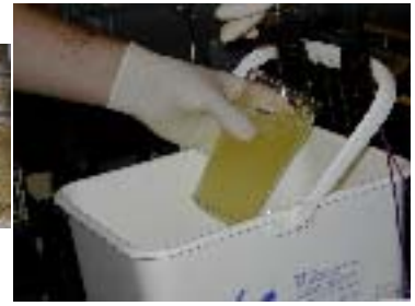
J Pull off 1 litre of cleaning fluid and examine for alien objects. (However, allow for the fact that the fluid is naturally cloudy.)

What are we looking for here, Martin? Floaters; right. Floaters?