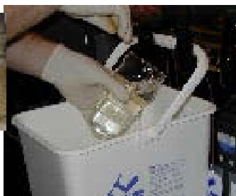
N Pull off 15 litres of water per line - that's one-and-a-half PIPELINE bucketsful.