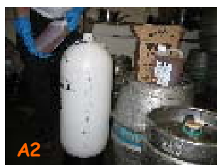
B-O Kit HHH & Protocol