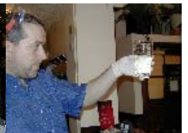
O Inspect for floaters in the rinse water; it should be absolutely clear.

P Reconnect the beer. Q Switch the cooler back on. R Inspect the dispense product for clarity.