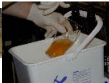
H Pull off discoloured fluid until golden fluid emerges or simply pull off 1 litre of cleaning fluid.