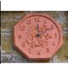
G Wait 10 minutes.