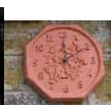
I Wait 10 minutes.