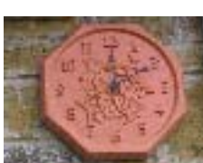
K Wait 10 minutes.