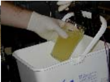
L Pull off 1 litre of cleaning fluid.